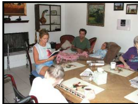
Current events and other interesting readings