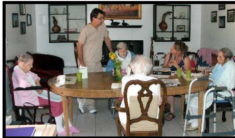
Individualized engaging care