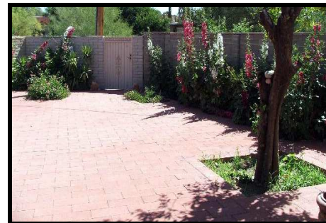
Enjoy nature in a private, tranquil environment