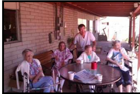
Abundant outdoor activities